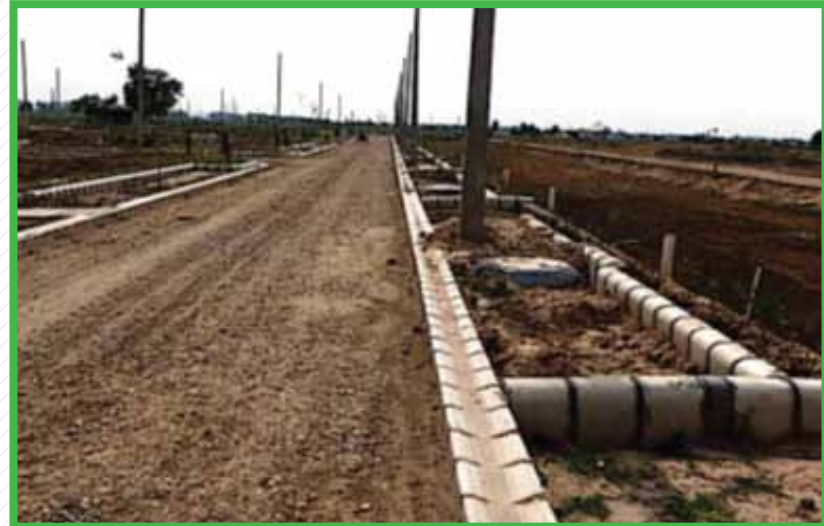
Actual Photograph of Site