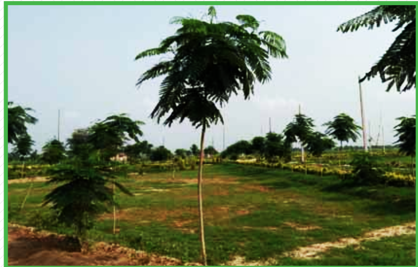
Actual Photograph of Site